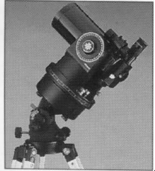
Fig. 3. (left) The ETX Astro Telescope on Field Tripod oriented for land viewing; (right) The polar-aligned ETX, ready for astronomical viewing;